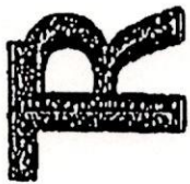
Table Rock Analytical Laboratory